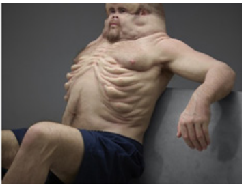
Figure 9: Patricia Piccinini, Graham, 2016. Artwork [silicone, fibreglass, human hair, clothing, concrete]. 140 x 120 x 170cm.