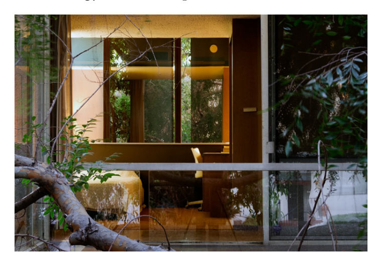
Figure 4: Richard Neutra, (1932). VDL studio and residence (architect's own studio and house).

Examining his commissioned houses, Lavin describes how Neutra, when designing a home for a client, would conduct many hours of interviews with the client to outline their psychological neuroses. Based on this information, he would design a home that would counteract these neuroses, or act as a therapeutic element in treating them. The elements that he used to effect these therapies were based on his own aesthetic of modernist or international style architecture; large open spaces, large windows, mobile walls, reflecting pools, among others. Later in his career he began to include other elements essential to this idea of therapy, namely opening the house up to the exterior environment, creating natural air flow from outside to inside, and using natural materials such as stone and wood, and of course water in reflecting pools. The interior surfaces were reliefs built up from these materials rather than flattened into a single plane. It was these natural elements and material surfaces of the interior space of the house that were to create, according to Lavin, the therapeutic effects needed to treat his clients' neuroses. The materials, the effect of using these varied natural materials, was to animate modernist abstract space with the currents of energy in the atmosphere.