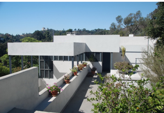
Figures 2 and 3: Richard Neutra (1929), Lovell (Health) House. Photo © User: LosAngeles / Wikimedia Commons. Permission for reprinting on Creative Commons license CC-BY-SA-3.0.

Examining his commissioned houses, Lavin describes how Neutra, when designing a home for a client, would conduct many hours of interviews with the client to outline their psychological neuroses. Based on this information, he would design a home that would counteract these neuroses, or act as a therapeutic element in treating them. The elements that he used to effect these therapies were based on his own aesthetic of modernist or international style architecture; large open spaces, large windows, mobile walls, reflecting pools, among others. Later in his career he began to include other elements essential to this idea of therapy, namely opening the house up to the exterior environment, creating natural air flow from outside to inside, and using natural materials such as stone and wood, and of course water in reflecting pools. The interior surfaces were reliefs built up from these materials rather than flattened into a single plane. It was these natural elements and material surfaces of the interior space of the house that were to create, according to Lavin, the therapeutic effects needed to treat his clients' neuroses. The materials, the effect of using these varied natural materials, was to animate modernist abstract space with the currents of energy in the atmosphere.